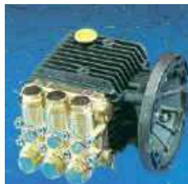
Version B (electric motor)