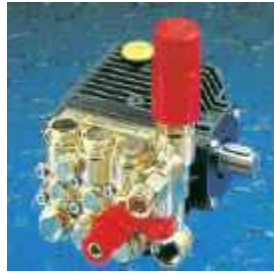
Version V (built in unloader and venturi)